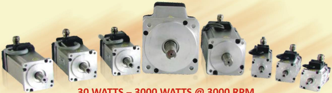
30 WATTS – 3000 WATTS @ 3000 RPM